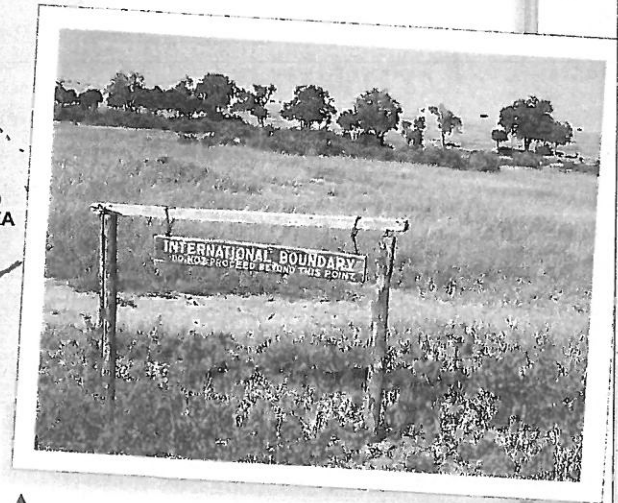
The international border between Kenya and Tanzania is a clearly defined regional boundary.

Regional Boundaries All regions have boundaries, or borders. Boundaries are where the features of one region meet the features of a different region. Some boundaries, such as coastlines or country borders, can be shown as lines on a map. Other regional boundaries are less clear.